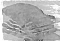
Whole Grain Loaf $4.99/loaf