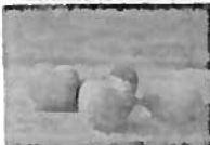
Empire Apples $3.79/3 lb bag