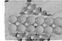
Free Running Eggs $4.99/dozen

Use code BackToSchool20 for an extra 20% off these prices!