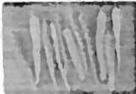
Rainbow Carrots $2.99/lb