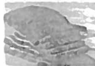
Whole Grain Loaf $4.99/loaf