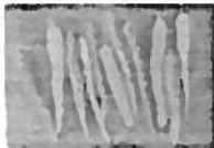
Rainbow Carrots $2.99/lb