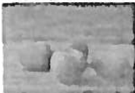
Empire Apples $3.79/3 lb bag