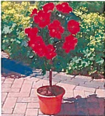
___ Hibiscus Straight Tree $25