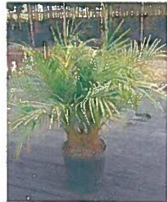
___ Roebelenii Palm $25