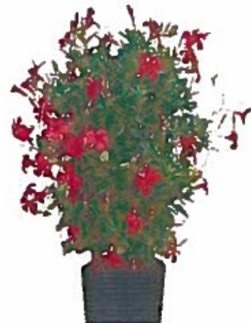
___ Mandevilla $35