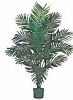
___ Majesty Palm $25