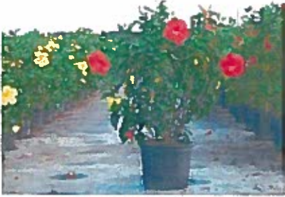
___ Hibiscus Bush $23