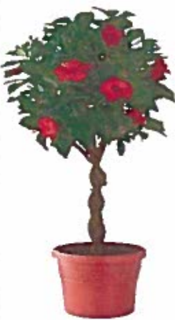
___ Hibiscus Braided Tree $30